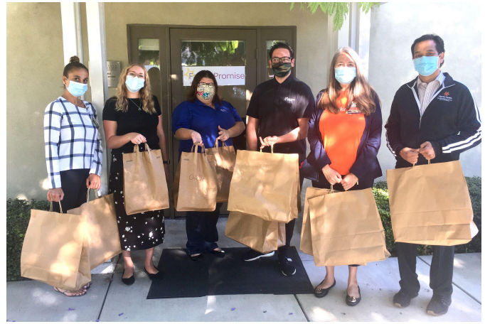
Hospital leaders deliver meals to Family Promise of the Verdugos staff members during the height of the 2020 COVID-19 surge.

Since the beginning of the pandemic back in March of 2020, Glendale Memorial Hospital received thousands of donated meals from community members and partners. These meals inspired our nurses and front line health care workers during one of the most difficult moments in our careers. We were able to experience firsthand how a donated meal can make one's entire day brighter.