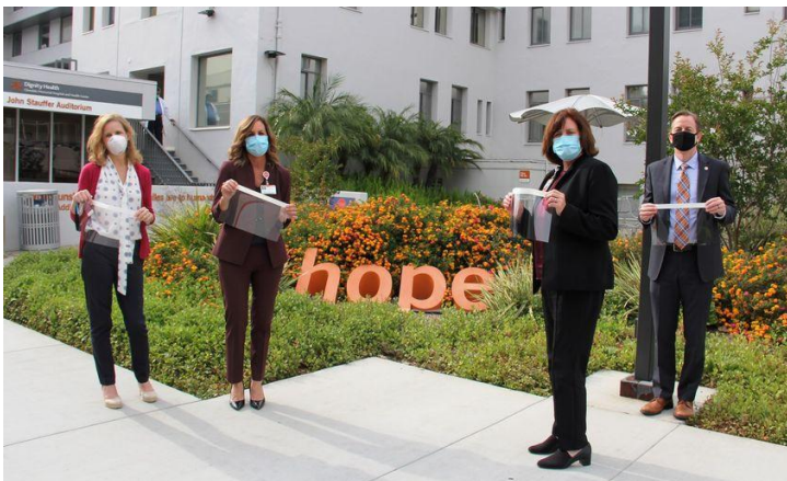
Glendale Memorial Hospital leadership and SoCal Dignity Health leadership pose with Avery Dennison representative in front of Glendale Memorial Hospital.

Last year Glendale Memorial Health Foundation received over $1.4 million dollars in PPE, cash donations, and in-kind gifts to the Emergency Response Fund. This support has been essential in our efforts to respond to the COVID-19 crisis.