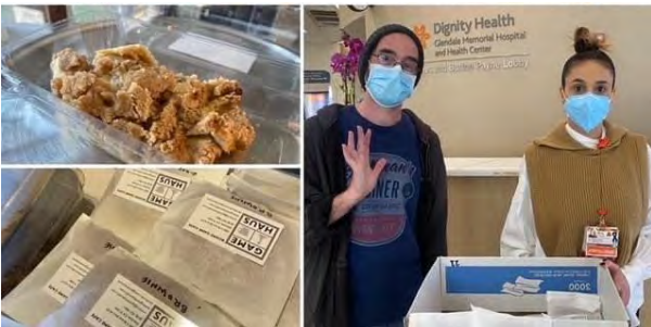
Top: Friends at Game Haus Cafe generously donated dozens of treats for GMH staff Bottom: Subaru/LLS

Small businesses, like Game Haus Cafe, donated dozens of desserts during the January 2022 surge of COVID-19. We appreciate their humankindness and compassion for healthcare workers who are taking care of those in need. The Rotary Club of Glendale also donated lunch and dinner meals to our Emergency Department nurses and staff for four weeks in the Spring. Also, Subaru Loves to Care partnered with the Leukemia & Lymphoma Society to donate blankets and art kits to the hospital. Hello Humankindness!