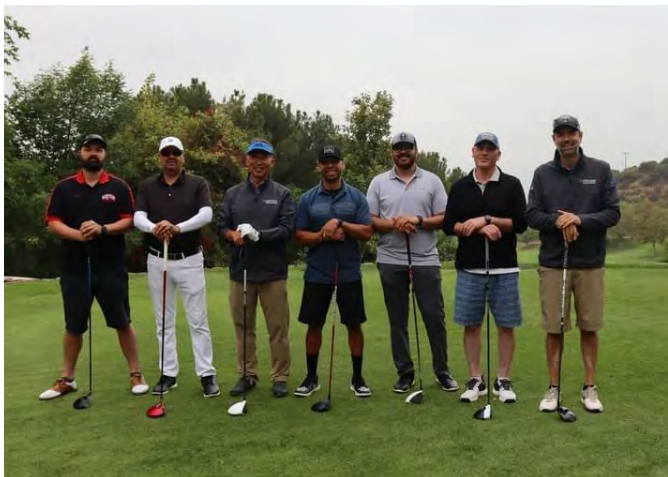
2022 Golf tournament participants at DeBell Golf Club on June 3rd 2022